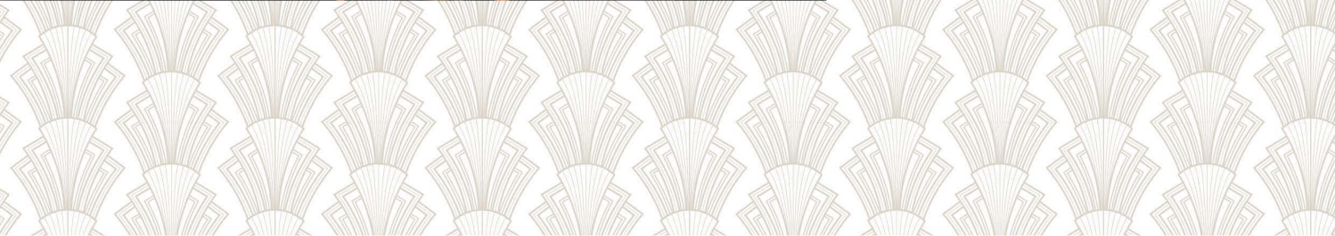
Exquisite Service in Majestic Suite

History and glamour unite at The Peninsula Shanghai's elegant aviation-themed lounge. With spectacular views of the city skyline through floor-to-ceiling windows, this unique venue celebrating the golden age of flight in China provides a striking locale for board meetings and cocktail receptions.