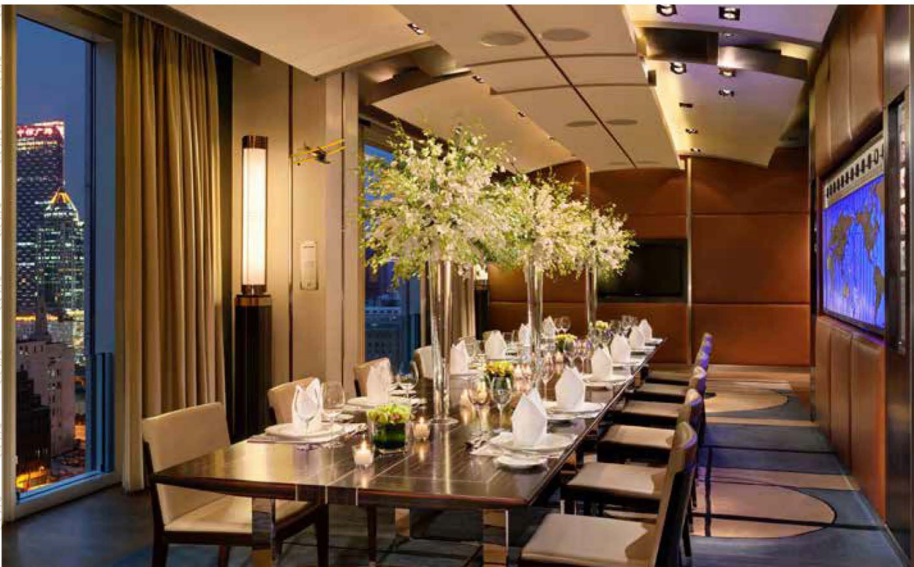
The Rosamonde Aviation Lounge