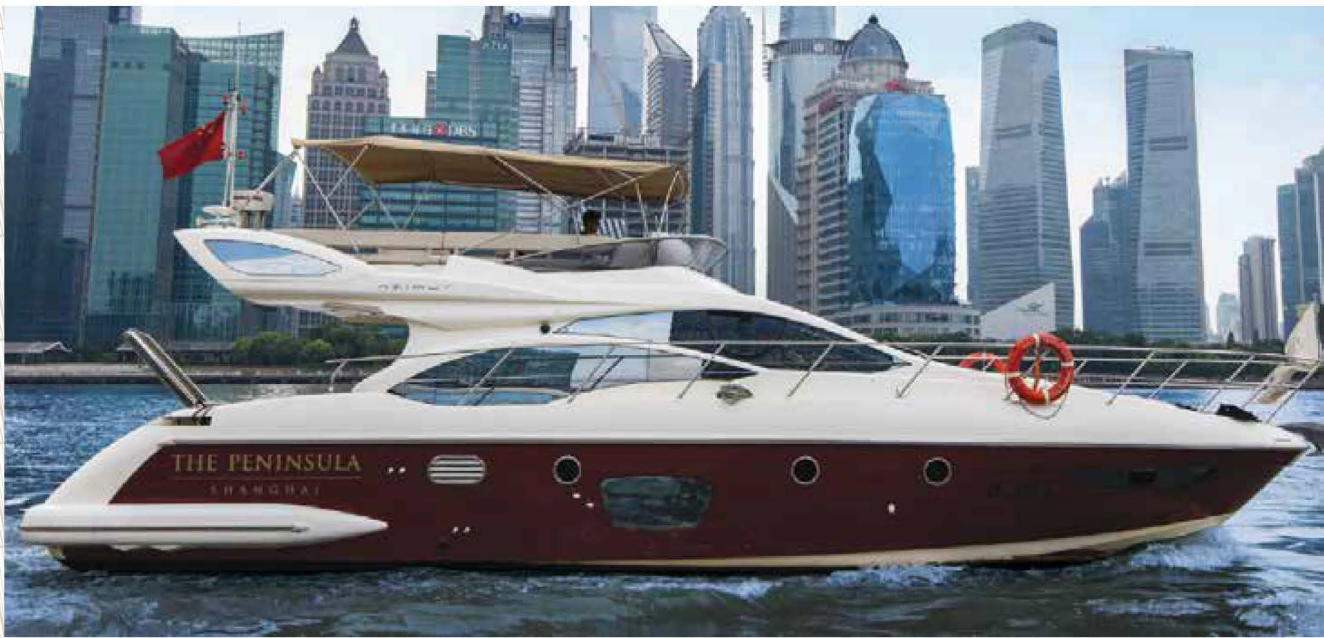
The Peninsula Yacht