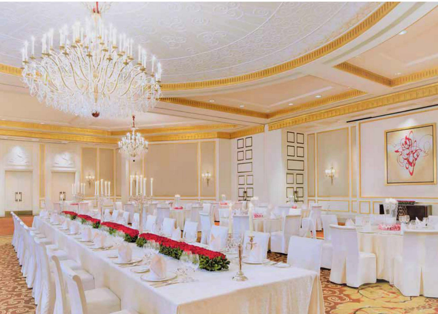
The Rose Ballroom