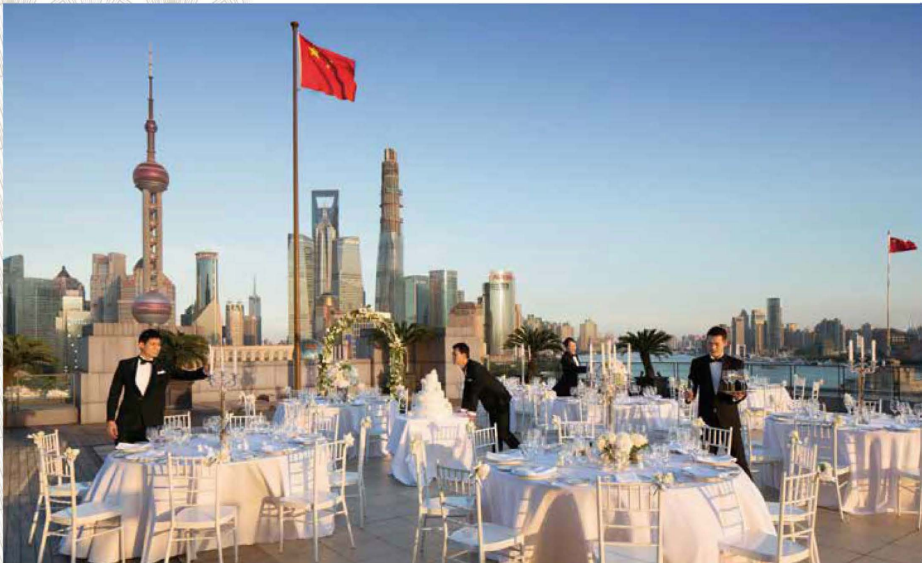
Exquisite Service in The Palace Suite Terrace

The Peninsula Shanghai is well known for exceptional food and beverage offerings that can be customised to each event, from banquet menus, buffet stations to themed coffee breaks.