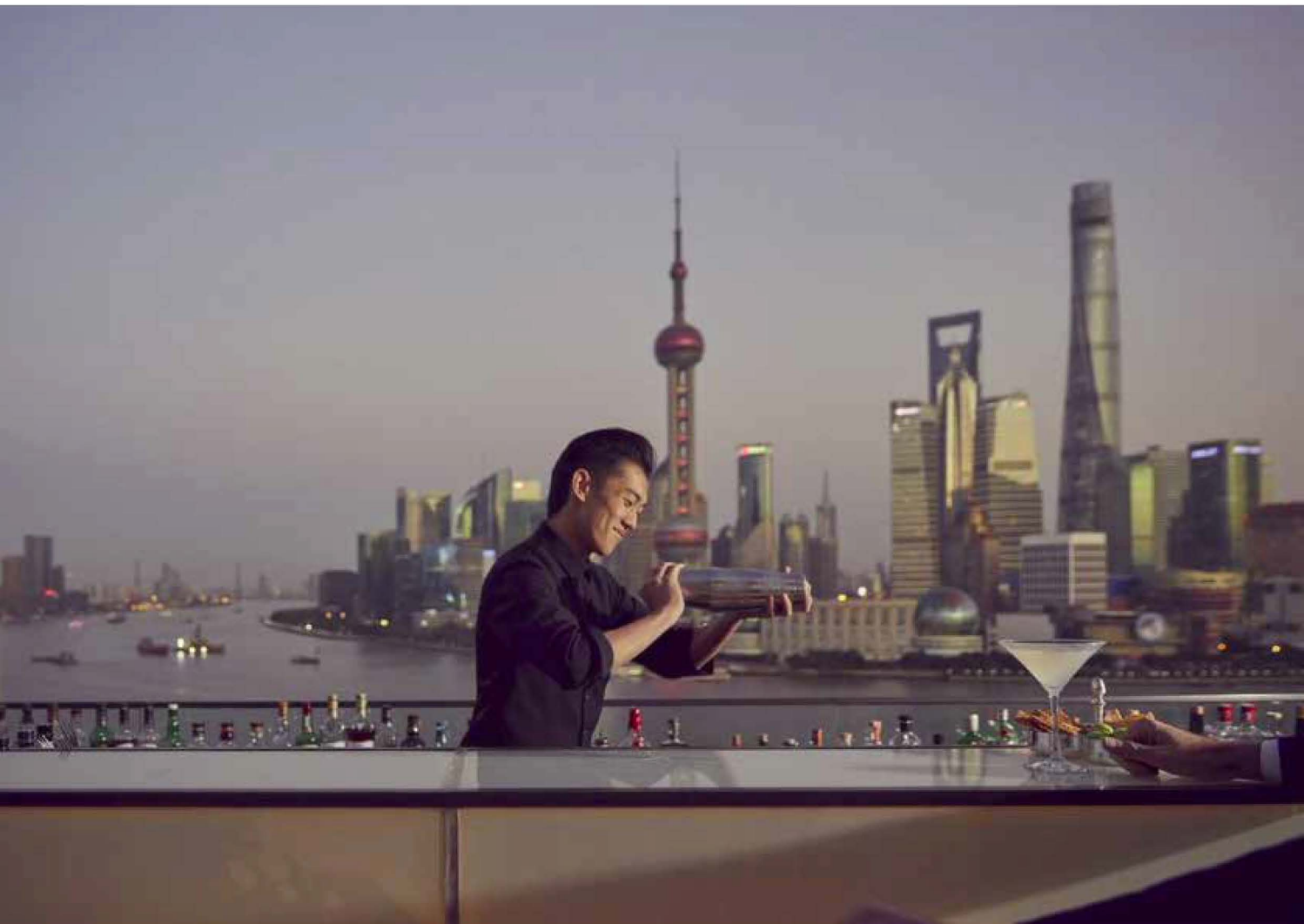
Sir Elly's Terrace