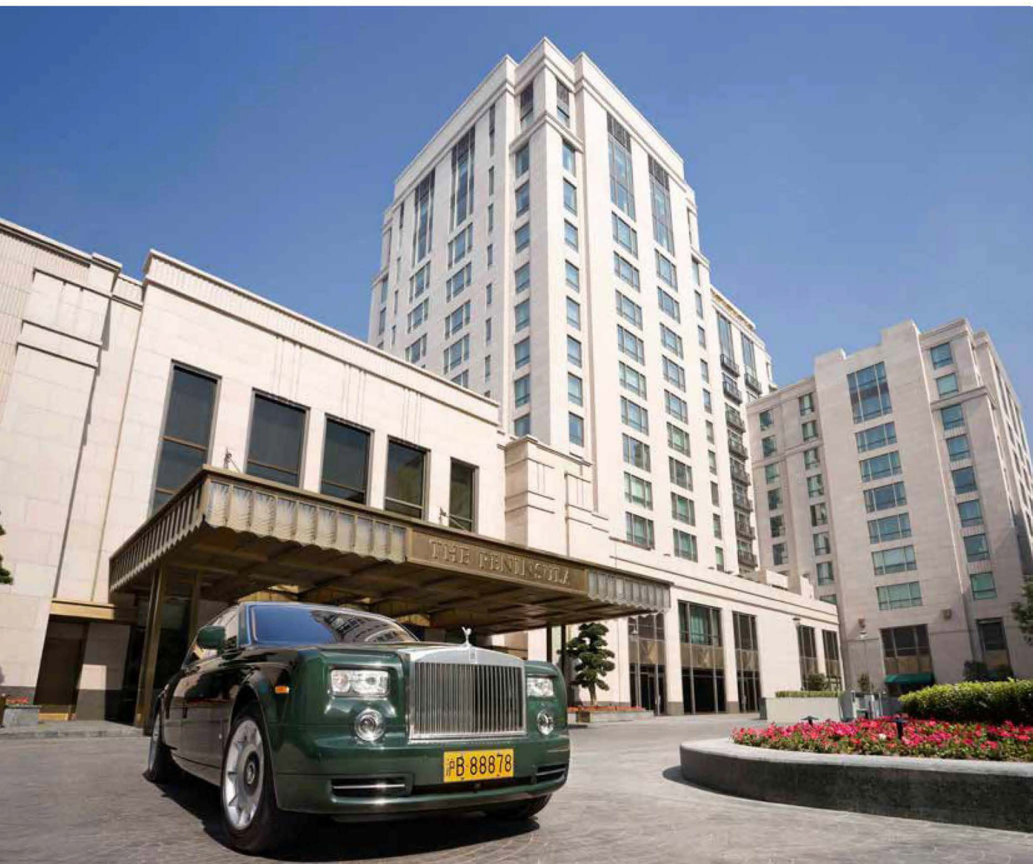
Exterior of The Peninsula Shanghai